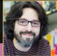
Argentine Novelist Andrés Neuman March 28th